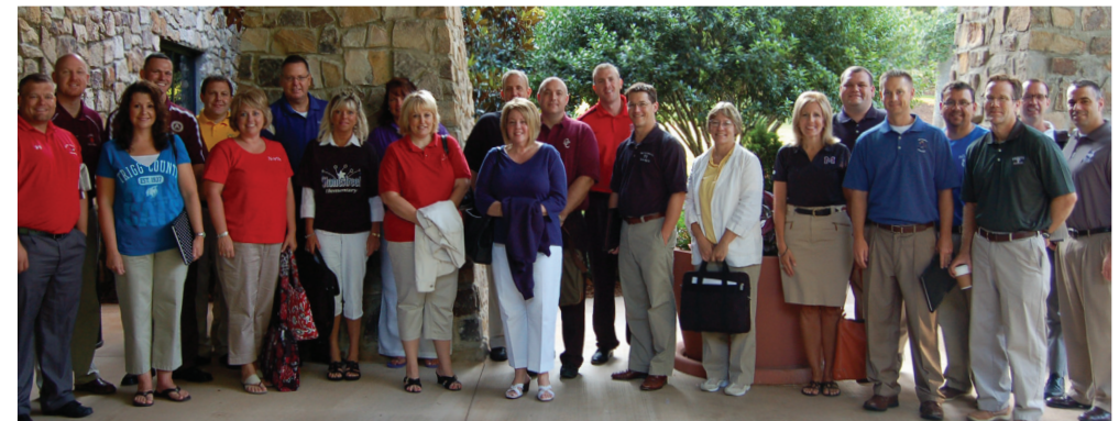
2011 Leadership Institute Participants

CCL also stands out as the only non-business school in this year's global Top 10 and the only institution among the Top 50 in the survey that specializes in leadership education and research.